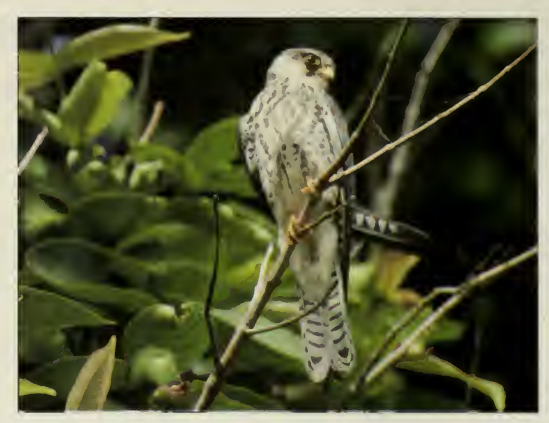
Eastern Red-footed Falcon Falco amurensis , Frégate, December 1995 (Rob Lucking)